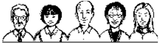
MEET THE TEACHERS

Homecoming Sunday is September 12 th . Join us for a pancake breakfast at 9:30 a.m. in the Fellowship Hall. Meet the Sunday School teachers and play a challenging game of Bible jeopardy. Everyone is welcome!